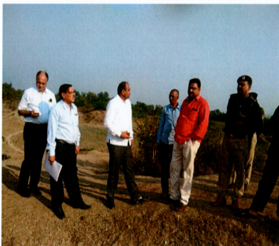
Village Vadadali of GLDC Vadodara Division

As a surprise spot visit Hon'ble Member decided to visit village Vadadali and Fanta of Sankheda talluka of the Vadodara Division of the GLDC, after spot visit Hon'ble Member decided to visit Surat Division of GLDC next day.