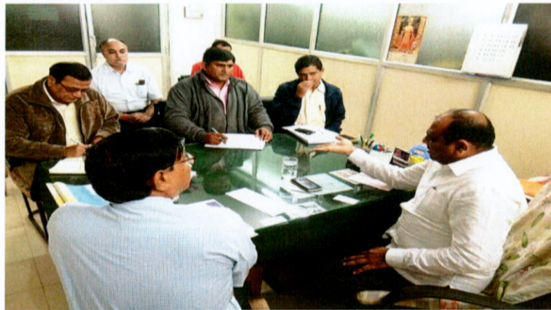
Meeting with the Officers of Vadodara Division of GLDC