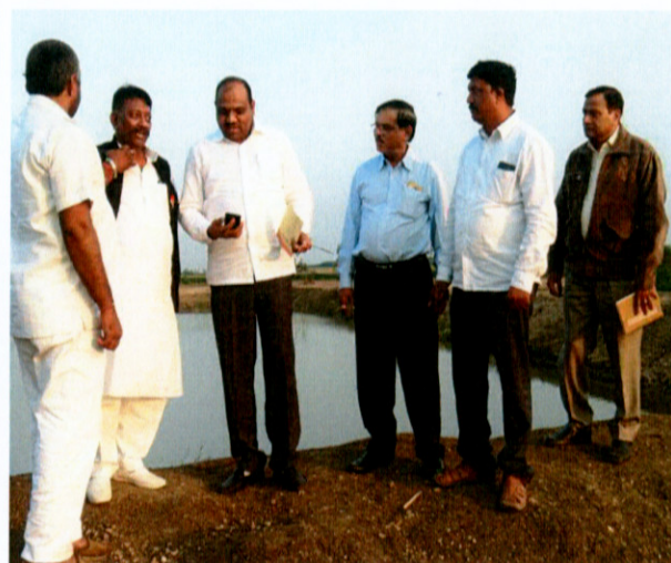
Village Fanta, Tall. Sankheda, Vadodara GLDC