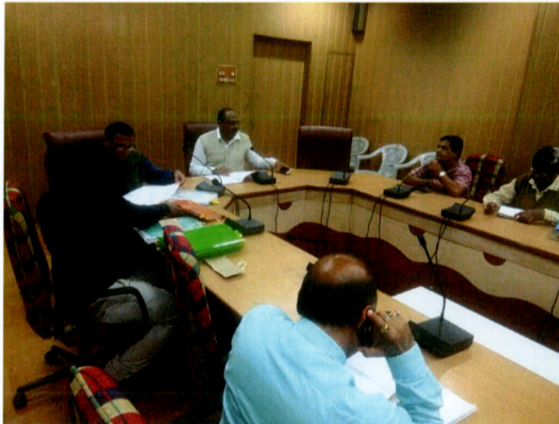
Meeting with officers of GLDC Surat Division